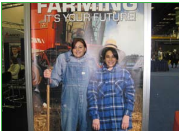
Members of Collegiate FFA traveled to Indianapolis for the National FFA Convention in October. Collegiate FFA members participated in a variety of events, including competitions, FFA's large exposition and a career fair.