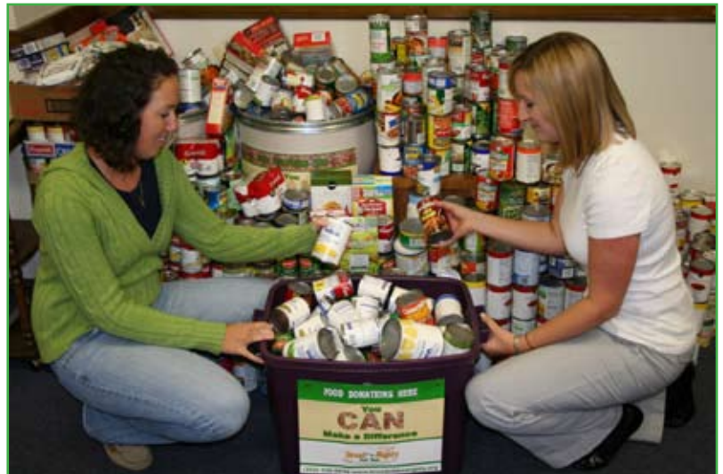
AEC's Graduate Student Association collected more than 2,000 pounds of nonperishable food items for Gainesville Community Ministries before the winter break. AECGSA members are shown here sorting the food and in front of the large collection of food items.