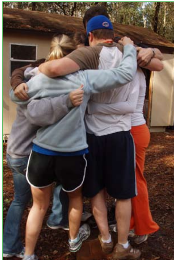
Agricultural Communicators and Leaders of Tomorrow hosted a “ropes course” day for faculty, staff, and students in the department in January. Everyone participated in team-building activities including having the entire team balance on a small wooden box and getting across an obstacle course.