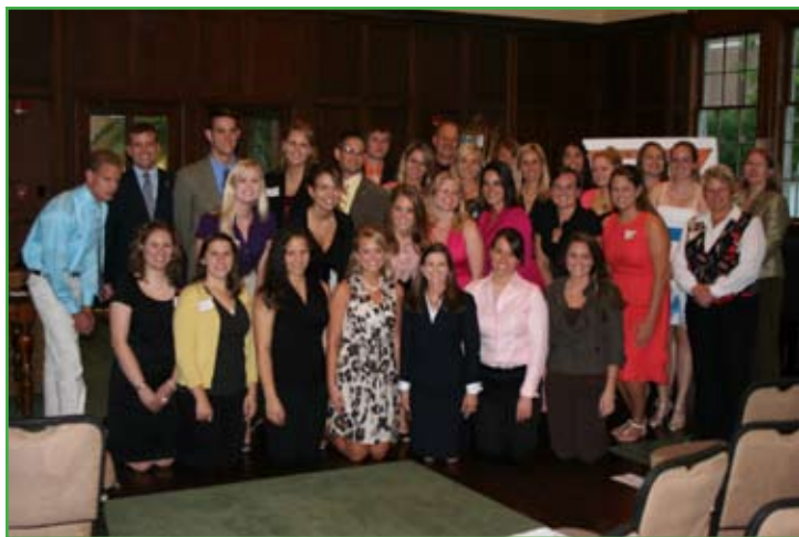
Alpha Tau Alpha, the honor society for agricultural education, communication, and leadership, held its induction ceremony in early April. More than 30 undergraduate and graduate students were inducted. It was the largest group of inductees ever at the University of Florida.