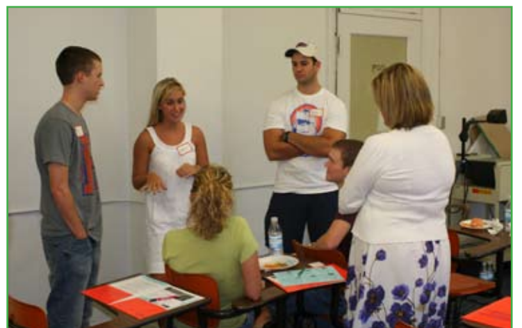
The department held an "open house" for new Communication and Leadership Development students in September. The incoming junior CLD class was the largest ever. Organizers of the event wanted all new students to learn about courses, curriculum and opportunities to get involved in the department and at UF, in general.