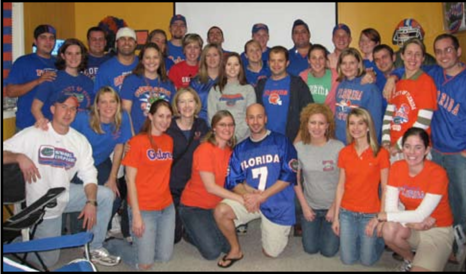
The "Grad Gator Gang" watched the UF Gators beat the Ohio State Buckeyes for the 2006 football national championship.