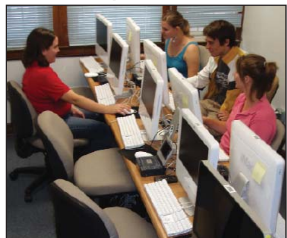
Students use the new iMac computer lab in Rolfs Hall. The lab was funded through the Scientific Thinking and Educational Partnership program.

the best outfitted labs on campus," Hightower said. "STEP invested in the latest and greatest design programs and really brought it all together."