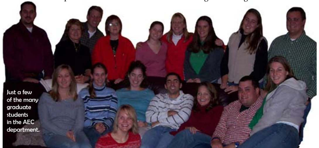
Just a few of the many graduate students in the AEC department.

The newest addition to the department's graduate program is the distance-delivered master's program. About 30 students are enrolled in the program, designed for Extension agents and agriscience teachers.