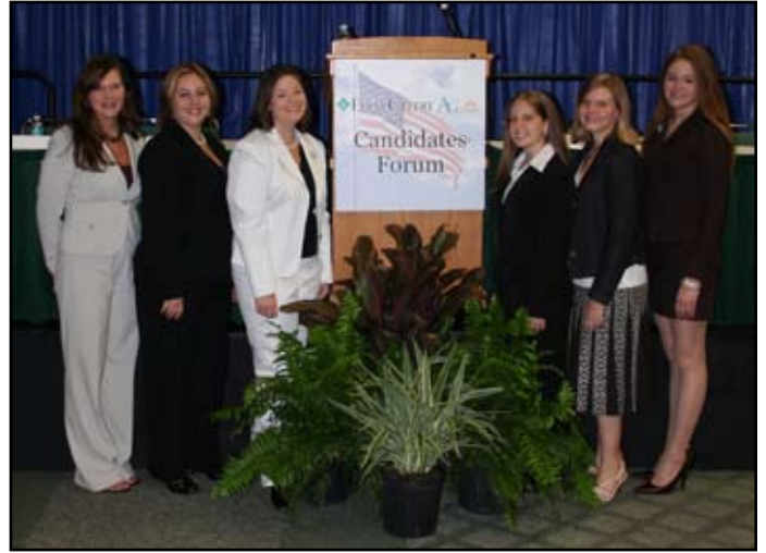
Six University of Florida students networked and developed communication skills through assisting in the Eighth Quadrennial Farm Credit/Ag Institute of Florida Candidates Forum.

The students made connections and developed communication skills that