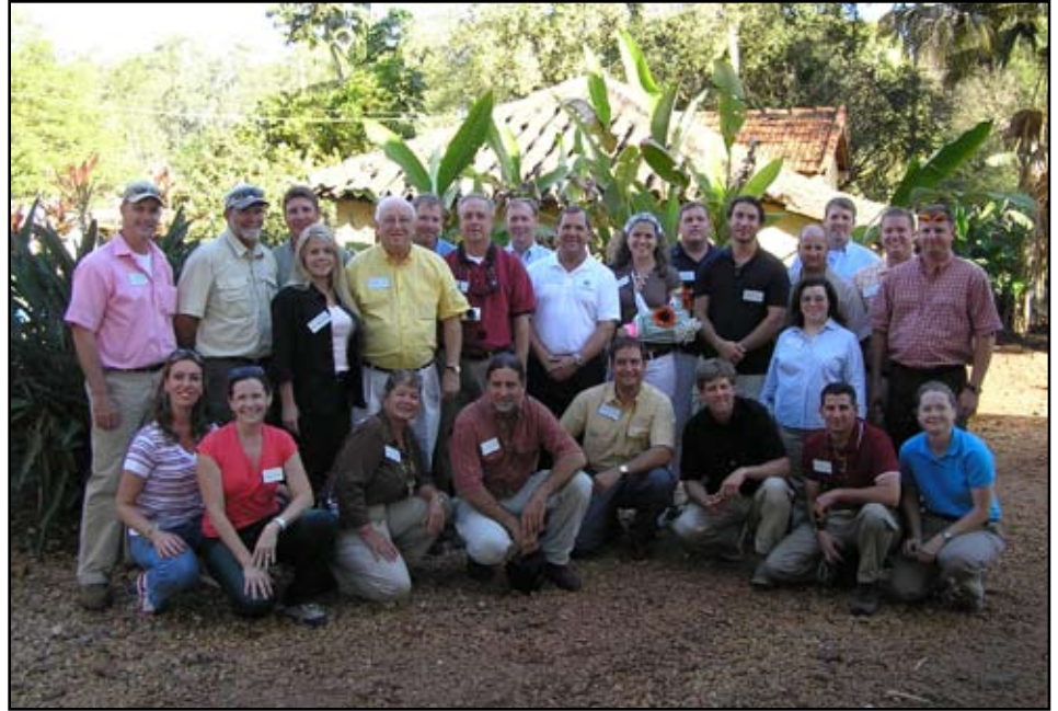
Participants in the Wedgworth Leadership Institute visit an old plantation in Araras, Brazil, that grows coffee, citrus and sugar cane.

participants to see the big picture and how they work within it," Carter said.