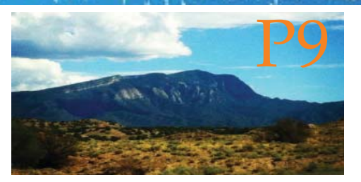
Members of ACLT traveled to New Mexico for the annual Ag Media Summit.

One in 10 jobs in Scotland is somehow connected to agriculture. Read more about one AEC student's trip to the United Kingdom.