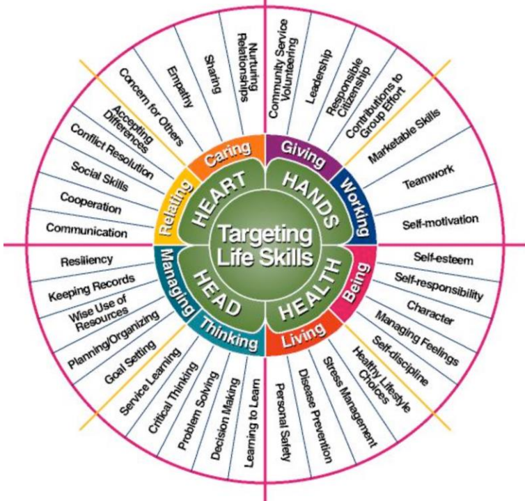
Hendricks, P. (1998) "Developing Youth Curriculum Using the Targeting Life Skills Model"

In the center of the life skills wheel, it is easy to see our 4-H's. Heart, hands, Head and health are each separated into two main components. These components are then further segmented into three to five additional skills per area. The key to reading the life skills wheel is to start from the center and work your way to the outermost ring.